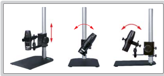
STAND (code: ISM-WSTD, optional)