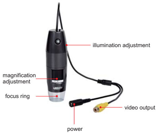
ISM-TV200 (with wire)