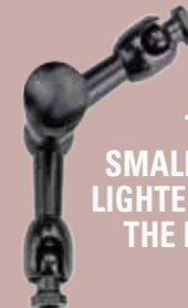
LC6100 Overall arm length 76 mm