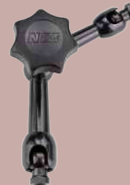
NF60003 Overall arm length 107 mm