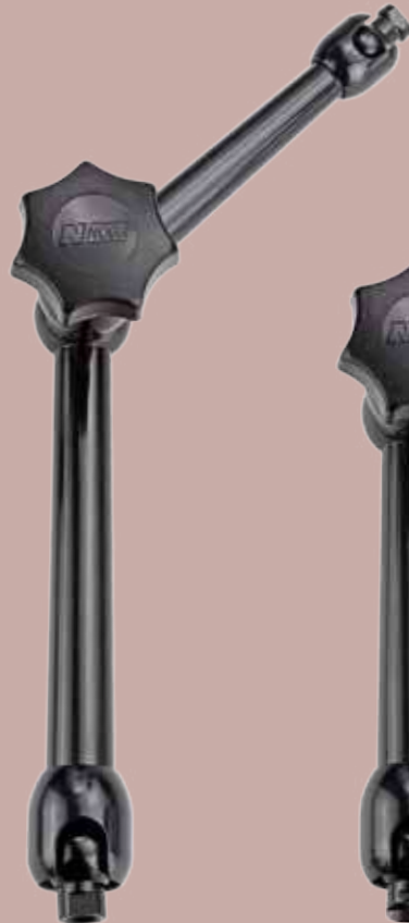
MG70003 Overall arm length 276 mm