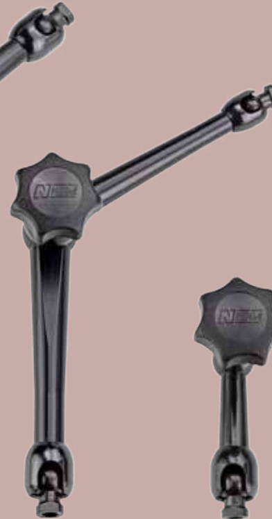
DG60003 Overall arm length 211 mm