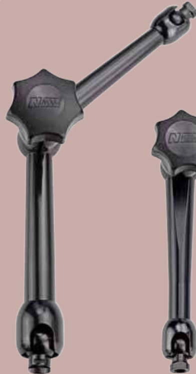
MG60003 Overall arm length 246 mm