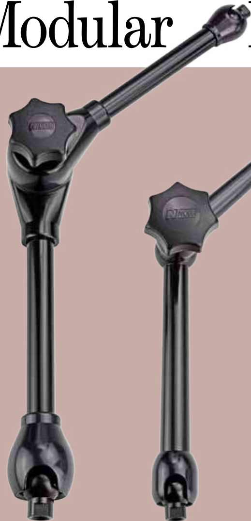
MA60003 Overall arm length 509 mm