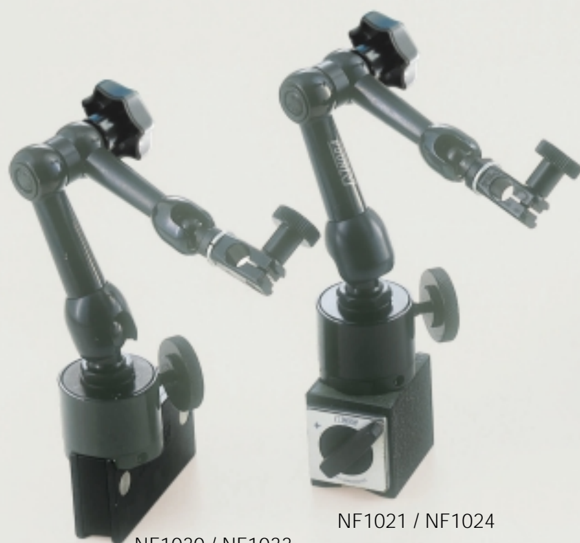
NF1030 / NF1033