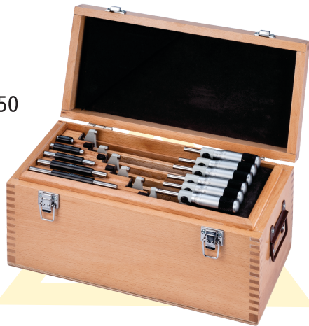
SET OF 6 MICROMETERS (0-150 mm/ 0-6")