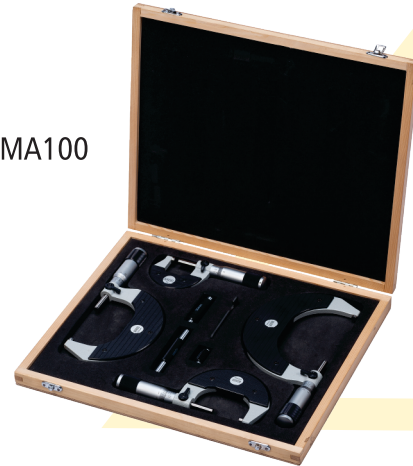
SET OF 4 MICROMETERS (0-100 mm/ 0-4")