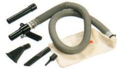
RY - 720 K 2 in 1 Air Wonder Gun Kit