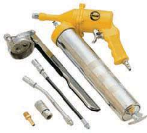
B36 - 6 Grease Gun Kit (400 cc) B 36 Grease Gun (400 cc)