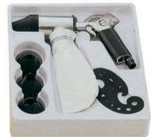
SB-74k Spark plug cleaner kit