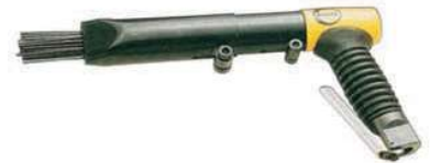
NS - 505 Air Needle Scaler Needle: 2x180mx29pcs BPM: 3700, Weight: 2.7kg