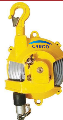
SB - 22 (15 - 22 kg) SB - 30 (22 - 30 kg) Dia of Cable : 5mm Weight : 8kg