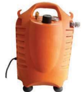
NOM-1500 Mini Air Compressor