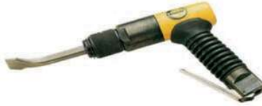
FC - 502 Air Flux Chipper Piston: 23.5x20x73mm, BPM: 3000 Length: 295mm, Weight: 2.2kg