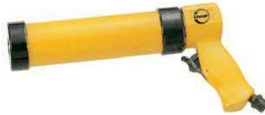
B - 40 Air Caulking Gun Bore x Tubelength: \varnothing 2" \times 8.5" Weight: 1.1kg