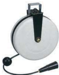
Metal Housing Hose Reel Size : 8 × 12 mm × 15 Feet 8 × 12 mm × 25 Feet 8 × 12 mm × 45 Feet Housing Colour : Grey / Yellow Tube Colour : Yellow Colour