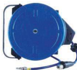
Air Hose Reel - HR-0325V Steel Case Size : 5" / 16" × 15 Mts.