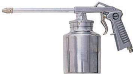
AG - 00 Air Engine Cleaning Gun