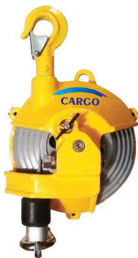
SB - 9 (4.5 - 9.0 kg) SB - 15 (9.0 - 15 kg) Dia of Cable : 4mm Weight : 3.4 / 3.8kg