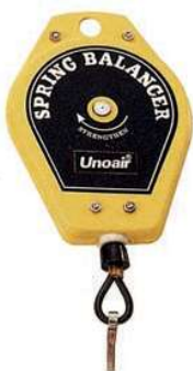
SB - 03 (0.6 - 1.5 kg) SB - 04A (1.0 - 2.0 kg) SB - 04 (1.5 - 3.0 kg) SB - 07 (3.0 - 5.0 kg)