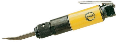
FC - 501 Air Flux Chipper Piston: 23.5x20x73mm, BPM: 3000 Length: 350mm, Weight: 2.3kg