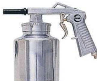
AG - 01 Air Under Coating Gun