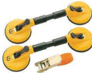
S - 001 Suction Cupset Capacity - 160 kg.