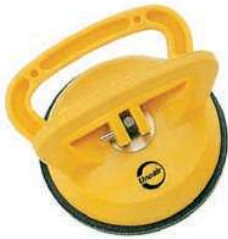
S - 002 Suction Cup Capacity - 40 kg.