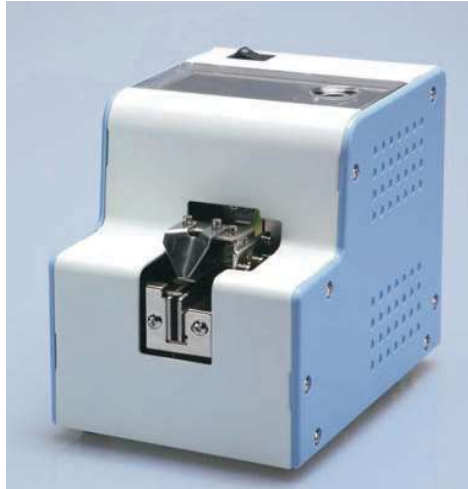
CLASSIFIED CAPACITY SPECIFICATIONS