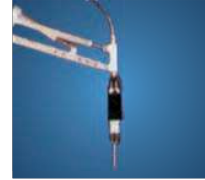
Driver Too Mount