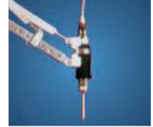
Parellel Type Arm Tool Mount