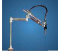
Right Angle Tool Mount