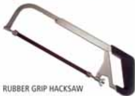
RUBBER GRIP HACKSAW