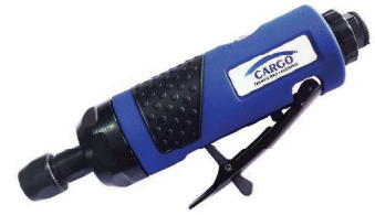
CARGO-CDG-210R-B1 6mm Medium Duty Die Grinder