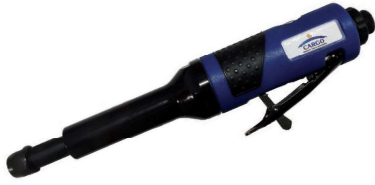
CARGO-CDG-215R-A1 6mm Ext. Die Grinder