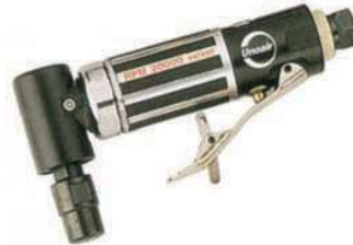
DG 36 M Angle Die Grinder