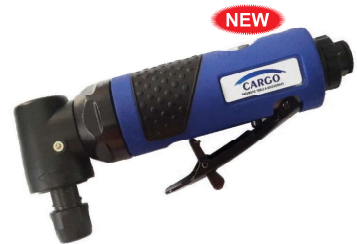
CDG-220R-A1 1/4" Heavy Duty Angle Die Grinder