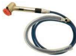
RY - 170 L 1" Angle Grinder