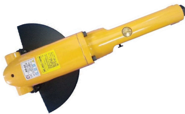
AG - 41 / OP-3856 7" Angle Grinder