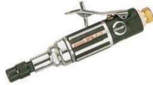
DG - 33M 1" Ext. Die Grinder DG - 34M 3" Ext. Die Grinder