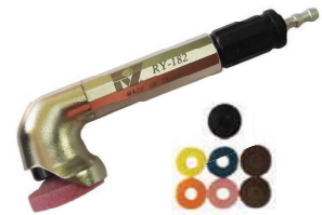
RY - 182 1" Angle Grinder