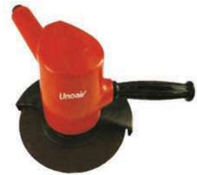
VG-44 7" Heavy Duty Vertical Grinder