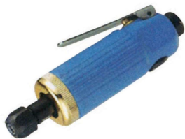
OP-1201A 6mm Die Grinder