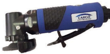
CAG-222R 2" Angle Grinder