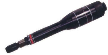
CARGO-CDG-7150 6mm Ext. Die Grinder