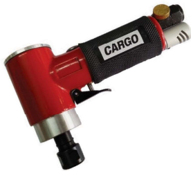
AG-01A 1/4" Heavy Duty Angle Die Grinder