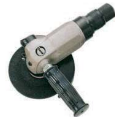
AG 44G / AG - 45 G 4 1/2" Heavy Duty Angle Grinder