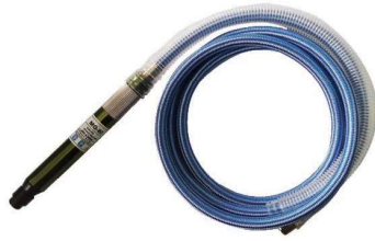
MG - 80 3mm Micro Die Grinder