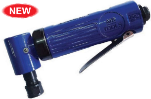
CARGO-CDG-36L 1/4" Medium Duty Angle Die Grinder