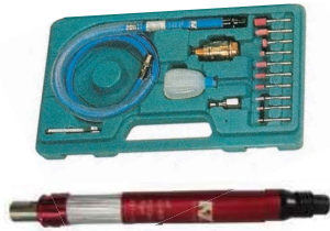
RY - 316A/ RY - 316 B 3mm Micro Die Grinder/ Kit