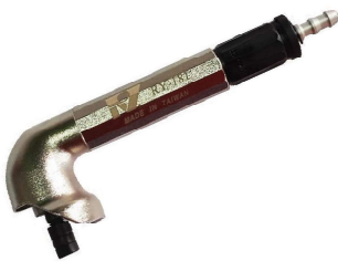
RY-181 3mm Micro Die Grinder (90°)