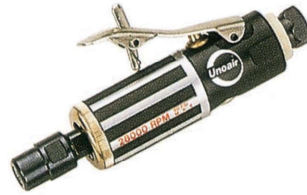
DG - 30 (M) 1/4" Die Grinder