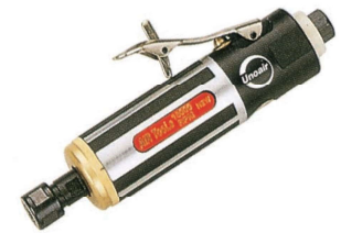
DG-32 (M) Heavy Duty Die Grinder