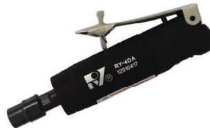
RY-4DA 1/4" Die Grinder (Lever Type)