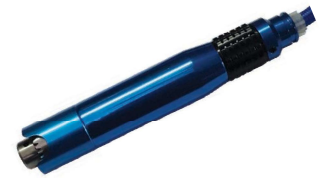
RY - 134 Mini Air Drill