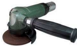
CARGO-CAG-405 5" Heavy Duty Angle Grinder