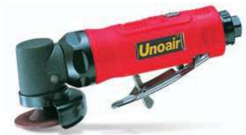
DG-392R 2" Angle Grinder