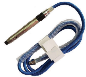
RY - 170 3 mm Medium Duty Micro Die Grinder