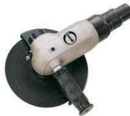
AG - 47 G 7" Heavy Duty Angle Grinder