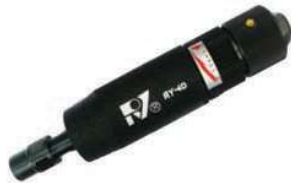
RY-4D 1/4" Die Grinder