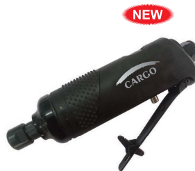
CARGO-CDG-210R-A1 1/4" Industrial Die Grinder