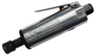
RY - 317 1/4" Die Grinder