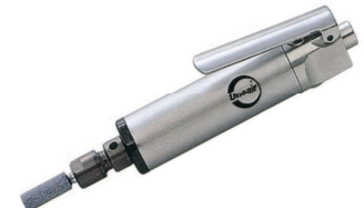
DG-GS38(N) 1/4" Heavy Duty Die Grinder