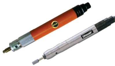
MG-75/ MG - 01 3 mm Heavy Duty Micro Die Grinder