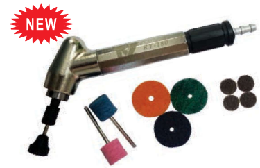
RY-180 3mm Micro Die Grinder (120°)