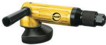
AG 36G / AG - 37G 4 1/2" Angle Grinder