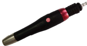
TTL-07 Heavy Duty Air Lapper