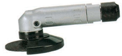
RY - 4S / RY - 4SA 4" Angle Grinder