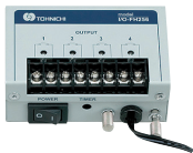
I/O-FH256 4 port I/O * Option