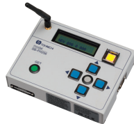
SB-FH256 Setting box * Option