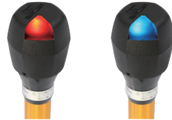
Figure of OK, NG LED