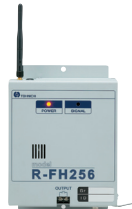
R-FH256 Receiver * Required