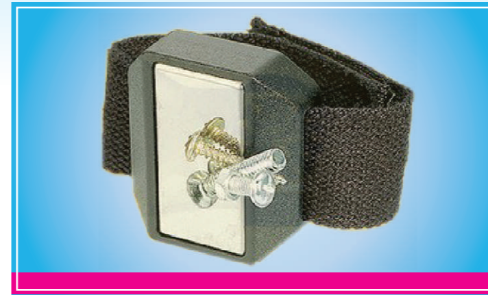
139202 Magnetic Wrist Collector