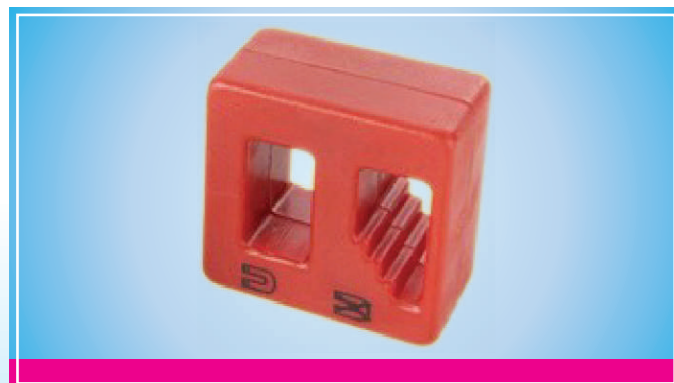
139201 Magnetic Charger