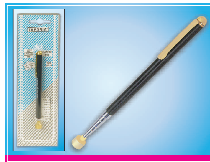
Telescopic Magnetic Bar