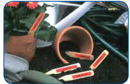
Even in the Garden!

Easily access fonts, frames and symbols with one-touch function keys