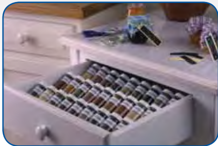
Use in the Kitchen...