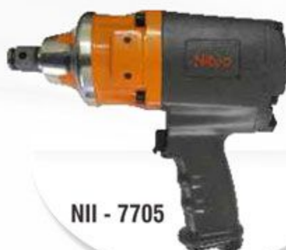
NII - 7705