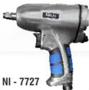
NI - 7727