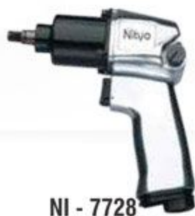
NI - 7728