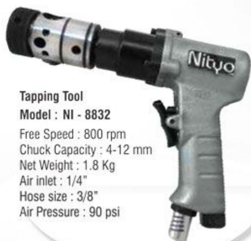
Tapping Tool Model : NI - 8832 Free Speed : 800 rpm Chuck Capacity : 4-12 mm Net Weight : 1.8 Kg Air inlet : 1/4" Hose size : 3/8" Air Pressure : 90 psi