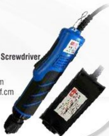
Auto Shutoff Electric Screwdriver Model : NIE - 07 Free Speed : 1100 rpm Max Torque : 3-35 Kgf.cm Bit Diameter : 1/4"