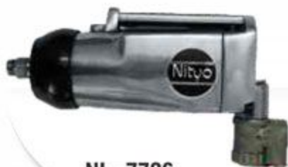
NI - 7726