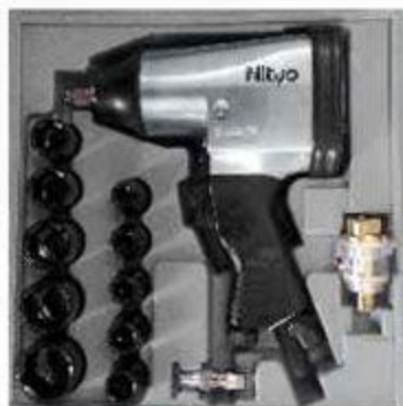
NI - 7725 K