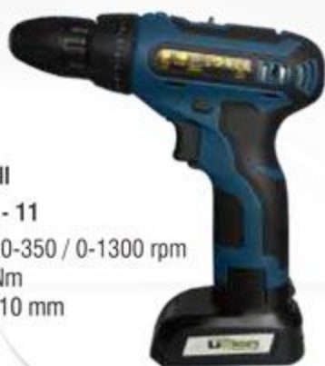
Cordless Drill Model : NIB - 11 Free Speed : 0-350 / 0-1300 rpm Torque : 18 Nm Drill Chuck : 10 mm