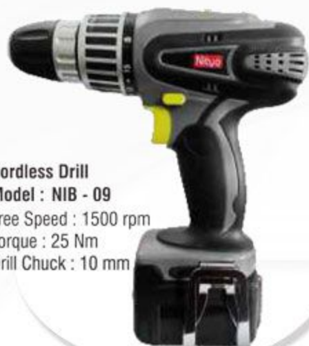
Cordless Drill Model : NIB - 09 Free Speed : 1500 rpm Torque : 25 Nm Drill Chuck : 10 mm