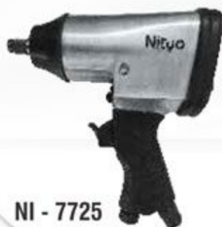
NI - 7725