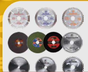
POWER TOOL ACCESSORIES