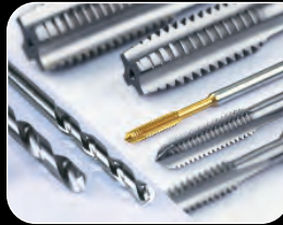
HSS Drills & Taps