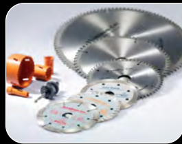
Power Tools Accessories