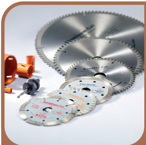
Power Tools Accessories