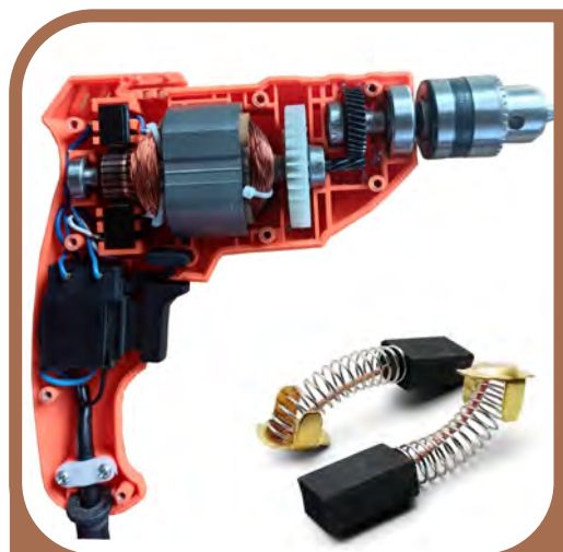
Power Tools - Spares