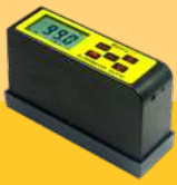
GLS09 60° ₹17,600

Useful for measuring glossiness (shininess) of surface finishes