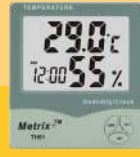
TH 01 Tabletop