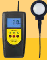
LX 1336A 5L lux