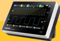
1013D 100MHz ₹24,000