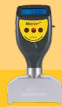
STM 01 40N/cm ₹36,000