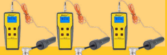
WPM 10 100N WPM 100 1,000N WPM 1K 10,000N ₹68,000 ₹74,000 ₹80,000