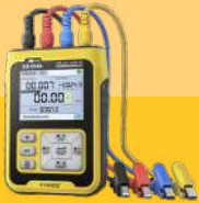
SG004A Multifunctional ₹24,000