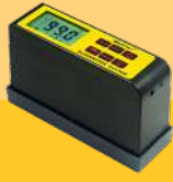
GLS09M 20°/60°/85° ₹29,200