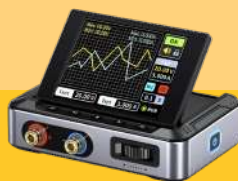
DPS 150 5A, 30V, 150W ₹12,000