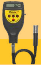
SURFP 09 800um ₹42,000