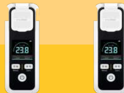
JBM 10 32 Brix ₹5,400