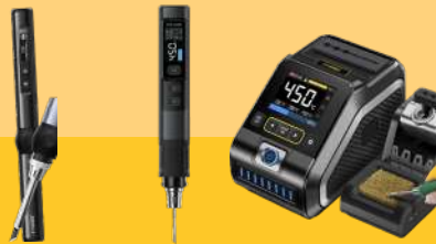
HS01 420C ₹5,400