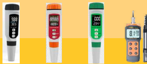
PH828+ pH ₹4,600