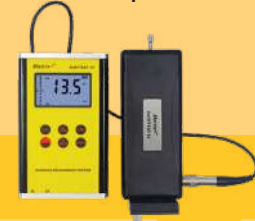
SURFT 10 10.00um ₹83,000