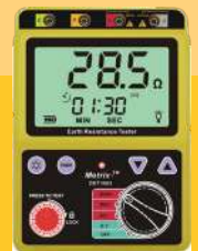
DET 1503 2000 Ω ₹12,000