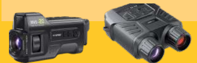
NVS 20 Monoc ₹11,800