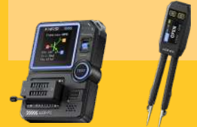
LCR P1 Compact ₹5,500