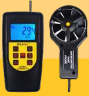
AVM 05 45m/s