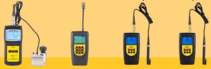
BTT 750 Mechanical BTF 01 Mic IR 500 Laser IR 800 Laser ₹36,000 ₹44,000 ₹56,000 ₹84,000

Measure belt tension of motors, machines, etc.