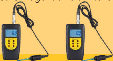
GSS 200 2000mT, 200Hz GSS 400 2000mT, 400Hz ₹24,000 ₹36,000