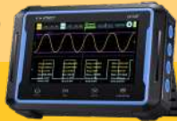
2C53P 3-in-1 ₹20,000