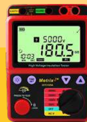
DIT 3125A Eco 5kV ₹22,000