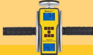
DFG MS 01 500N ₹48,000