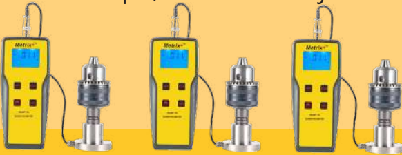
TRSNT 01 1Nm TRSNT 05 5Nm TRSNT 20 20Nm ₹54,000 ₹60,000 ₹66,000

Measure torque/ torsion with 3 jaw chuck