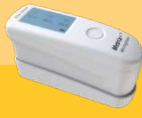
MICROGLOSS 20°/60°/85° ₹57,000