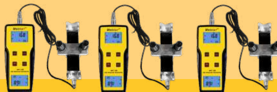
SPT 500 4900N SPT 1K 9800N SPT 5K 49,000N ₹54,000 ₹60,000 ₹66,000