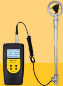
FLOWM 05 5m/s