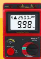
DIT 918 2.5kV ₹6,300

Testing of insulation by measuring resistance