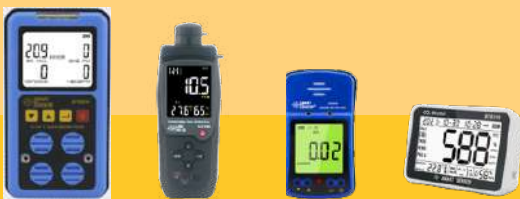
ST8904 Multi ₹14,800